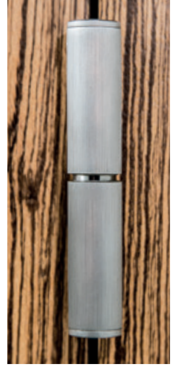
Hinges too, are stainless steel and feature ball-race bearings for maximum service life.

They exude an almost tangible air of quality that has most people tempted to run their fingers over the surfaces. That is what a properly engineered bespoke, cubicle system feels like. It may look effortlessly beautiful but it's taken 40 years experience to make it that way.