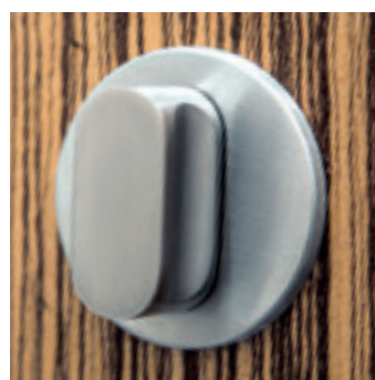
Alternative letels at declare as a sidele