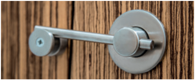
Door furniture and fittings are tough but elegant and designed to withstand a long, hard life.

MORE has been designed and conceived from the outset with flexibility built-in and the adjustability to iron out whatever difficulties each project might present.