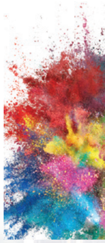
A full range of RAL colours is available in HPL.

A good pair of eyes is just as essential when selecting High Pressure Laminate. The range of RAL colours and textures is wide and runs to many pages. Colour is of course, like beauty, in the eye of the beholder. But, at Prospec we're sure you'll find the style you're looking for.