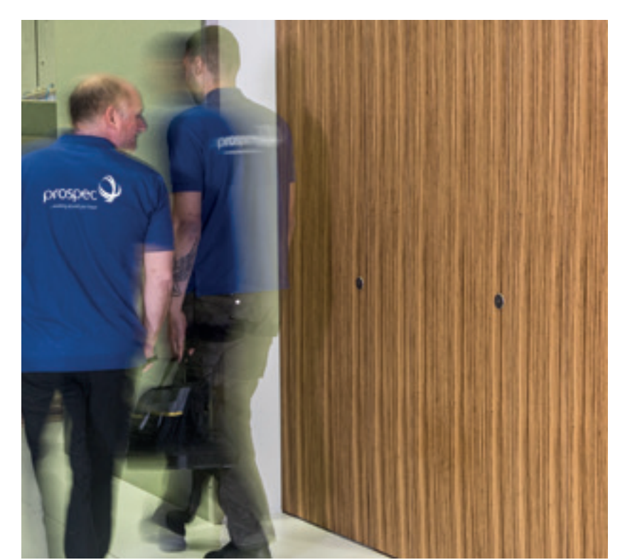
Our engineers are hard to please. The details have to be accurate