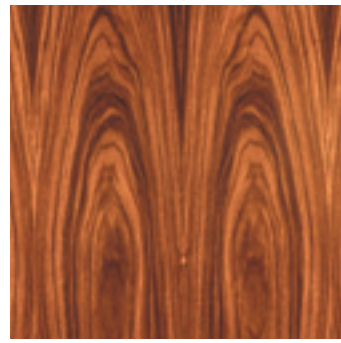
An example of book matched veneers.

Our 'Veneerists' are also past masters at the technique of 'book-matching', an example of which is shown at top right.